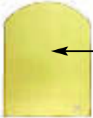
3. Rounded Back Pad

Suitable for saddles even with full skirts!