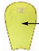
4. Seat Saver – Thin & Thick

The original and our most popular pad comes with a white cover appropriate for competition!